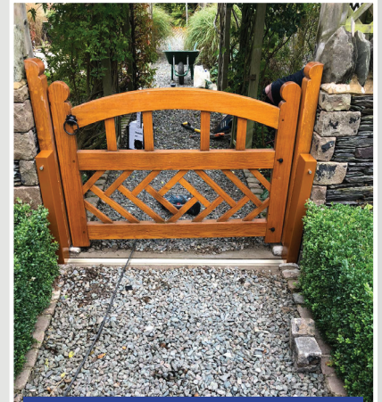
Grade II Listed Property - Demountable Aluminium Flood Barrier (Not Deployed)

A range of both manual measures, such as Flood Barriers, and passive measures, such as Flood Doors were installed, depending on Homeowner preferences and property type.