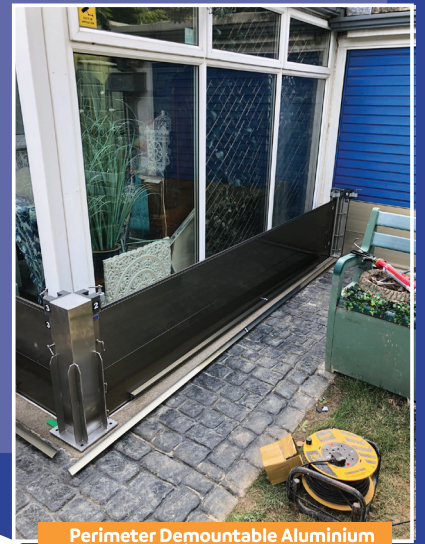
Perimeter Demountable Aluminium Flood Barrier to Conservatory