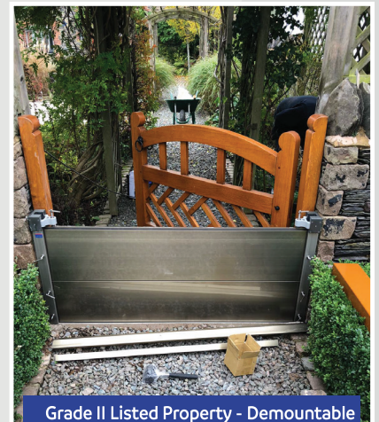
Grade II Listed Property - Demountable Aluminium Flood Barrier