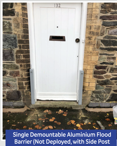
Single Demountable Aluminium Flood Barrier (Not Deployed, with Side Post)