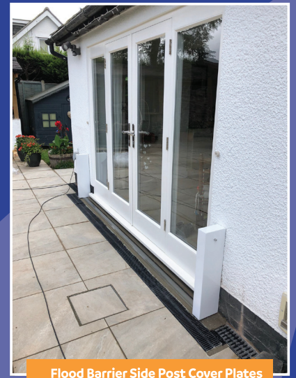
Flood Barrier Side Post Cover Plates